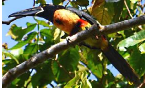
Figure 10 Collared Aracari