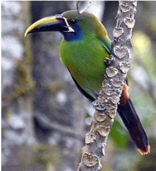
Figure 1 The Costa Rica Emerald Toucanet is distinguished with a green breast and belly and dark-blue throat