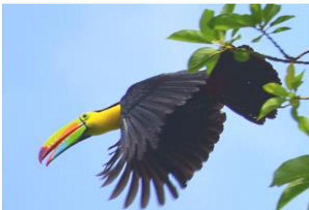
Figure 19 HIGH SPEED SHOT WORKED WELL IN LOW LIGHT