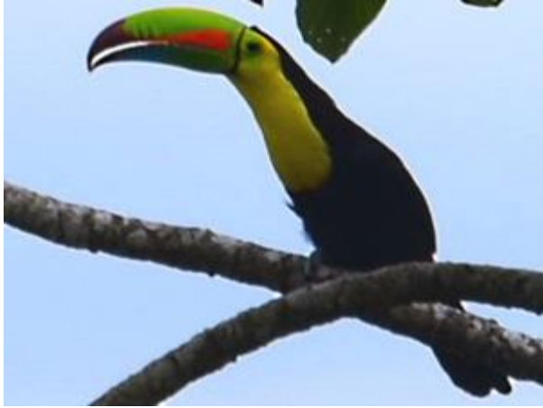
Figure 17 EVENING PERCH TIRIMBINA