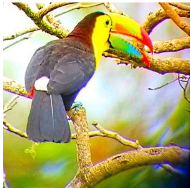
Figure 16 BEAUTIFUL KEEL- BILLED SAVEGRE LODGE AREA