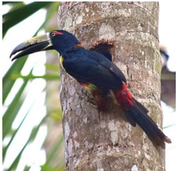
Figure 4 I think the bill color lacking the red, identifies this sky raider as the Collared Aracari. The Fiery Aracari has a bright red upper bill. The photos are taken in late evening poor light. The red might be missing.