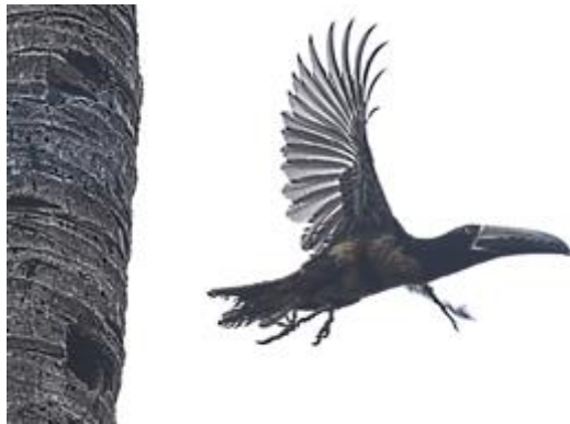
Figure 3 Aracari in black and white. Shades of Alfred Hitchcock: "The Birds"

This evening I saw seven Aracari launch an attack on the woodpeckers. They invaded the nest in the coconut palm tree. What followed saw the woodpeckers dive bombing the Aracari and creating as much fuss as possible. The chaos continued for many minutes. Eventually the main culprit emerged from the nest. The palm tree had several holes. I think the chick escaped as a week or so later I saw a young Woodpecker testing its wings. Alfred Hitchcock made a mistake when he used small crows for "The Birds". He should have used these really scary Aracari!