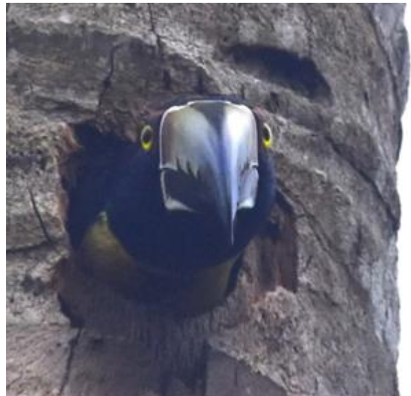
Figure 8 Hitchcock would have loved this image. Is there a movie maker ready to do a remake?