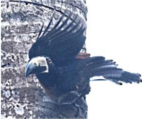
Figure 5 A number of aerial attacks were launched by the Aracari.

This Aracari above is launching an attack on the Woodpecker's nest. The chick is inside the hollow palm tree.