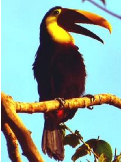
Figure 15 BLACK MANDIBLE TOUCAN