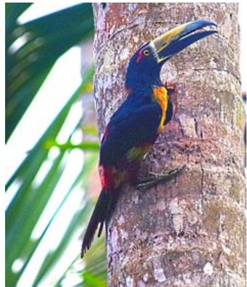
Figure 6 Collared Aracari outside Woodpecker's home