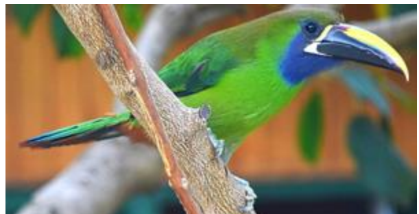
Figure 2 Beautiful shades of green and blue