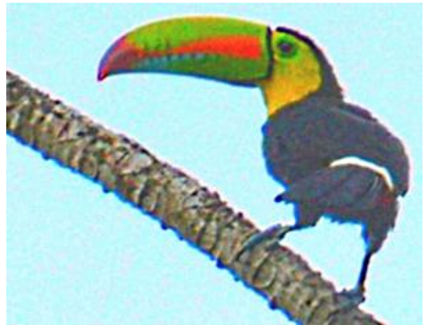
Figure 18 THE ANGLE DOES MAKE THE BEAK SEEM A LITTLE BIGGER