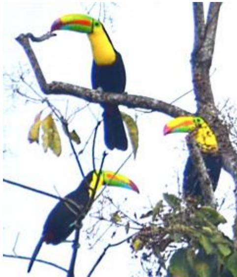
Figure 21 EARLY MORNING IN CECROPIA TREE. THREE KEEL-BILLED OF SEVEN TOUCANS AT SURISE CAHUITA CABIN GARDEN

I hope you have enjoyed these beautiful birds of Costa Rica!