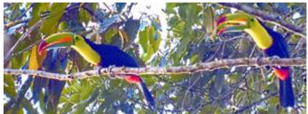
Figure 12 PAIR OF KEEL BILLED TOUCANS HAVING AN EVENING CHAT