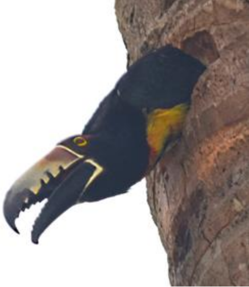
Figure 7 After a foray into the home this home invader exits the Woodpecker's nest. What happened inside?