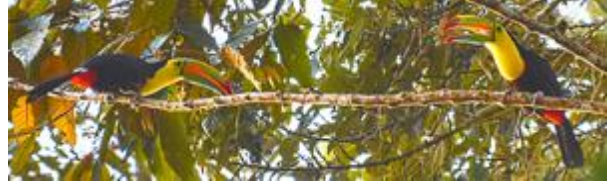
Figure 20 THIS EVENING PAIR ARE HAVING A BIG CHAT