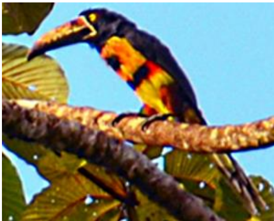
Figure 9 Fiery-billed Aracari