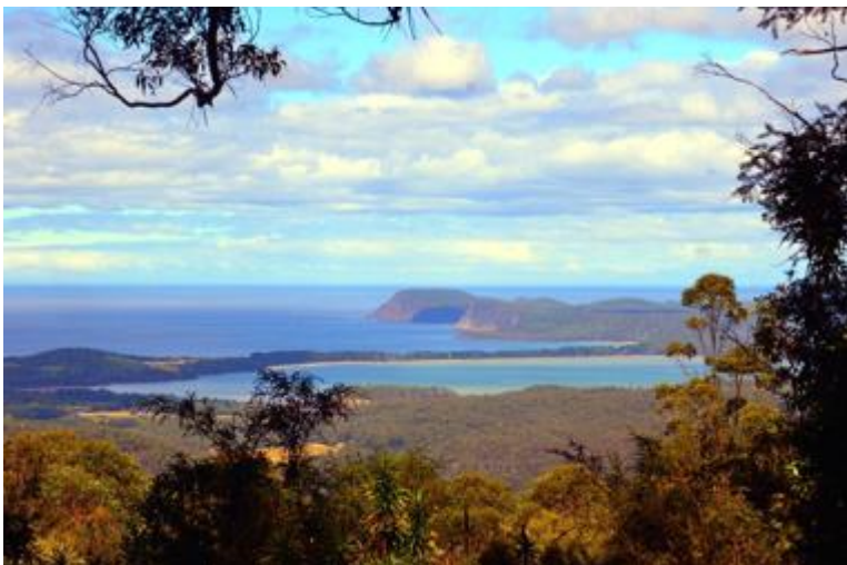
View from Mount Mangana looking across Cloudy Bay Lagoon to Cape Bruny.