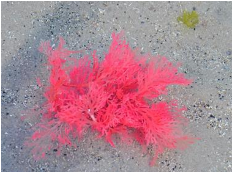
Bright pink seaweed Resolution Creek Beach.