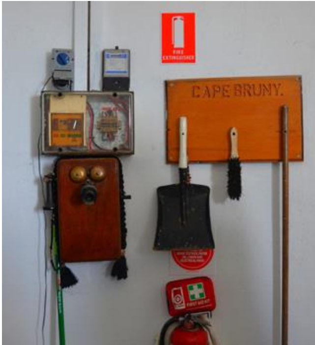
Lighthouse Keepers' tools. The phone still works.