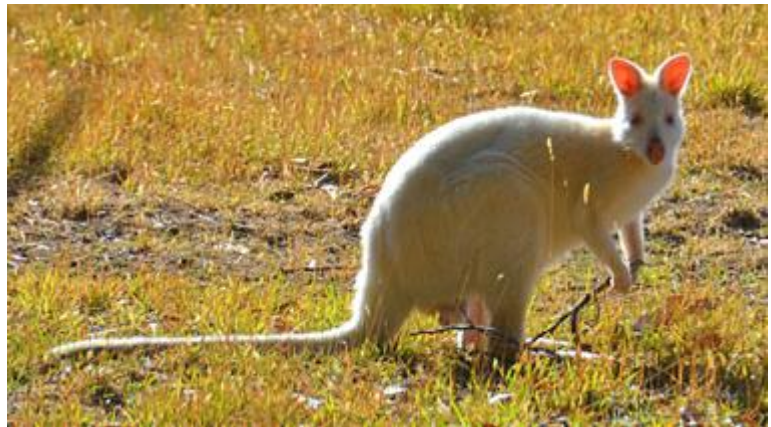
I call this young man: "Mr. Pink Ears".