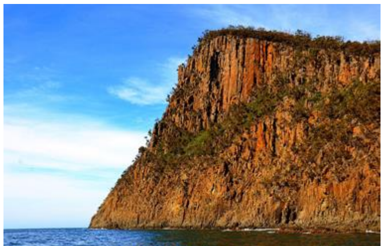
The dolomite cliffs of South Bruny dive hundreds of metres below the sea.