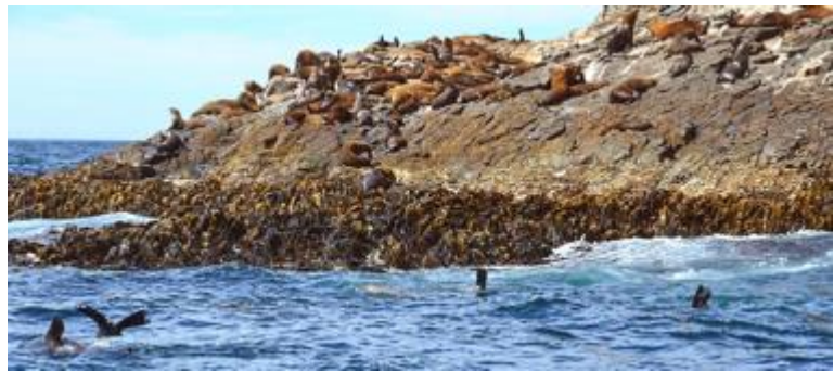
Great fun to see the seals up-side-down, flippers in the air, to help cooling on a hot summer's day.