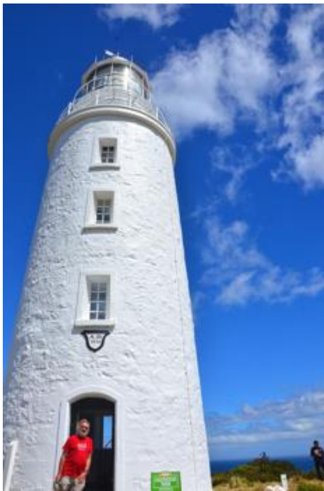
The beautiful Cape Bruny Island Lighthouse built 1836 by convict labour.

The beautiful interior design of Cape Bruny Lighthouse. The parts were manufactured in England and shipped about 14,000 miles. The whale oil for the light was captured in Adventure Bay shipped to England for refining and then shipped back to Bruny!