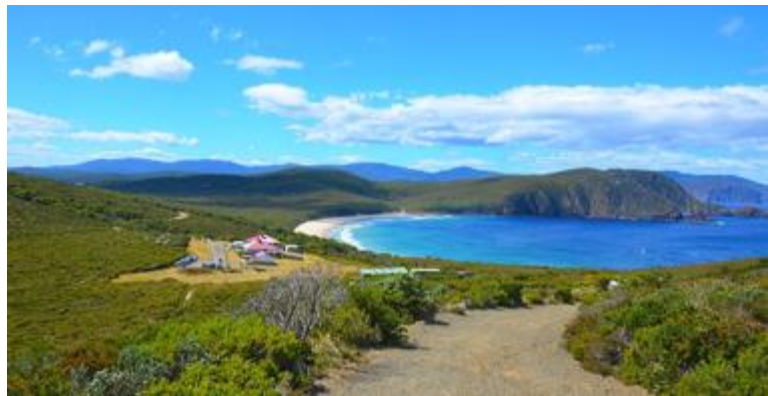
Lighthouse Bay Beach with the original settlement and the Lighthouse Keepers' cottages.