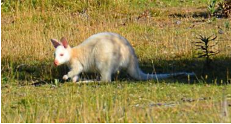
The very rare white kangaroo.