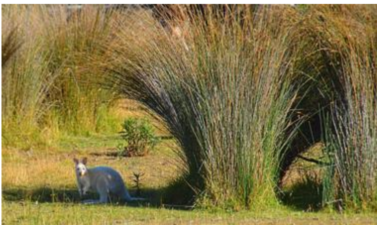
Bruny Island is a haven for the exotic white kangaroo "sub-species". Locals have told me they are not full albino. I have not found any studies to confirm if they are a sub-species.