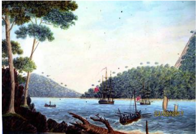
Lieutenant George Tobais' painting: "Two Tree Point" Resolution Creek Adventure Bay Bruny Island 1792.