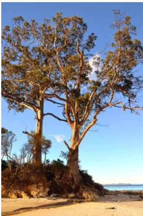
"Two Tree Point" at Adventure Bay. The two trees are almost exactly the same when sketched by Lieutenant George Tobin in 1792 while on voyage with Captain Bligh on his ship Providence. I was so happy to learn that "The Pont" is protected as Natural History Reserve.