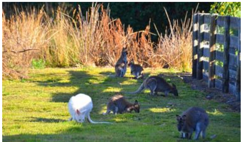
A Mixed Kangaroo Family, Adventure Bay, live in peace and tranquility.