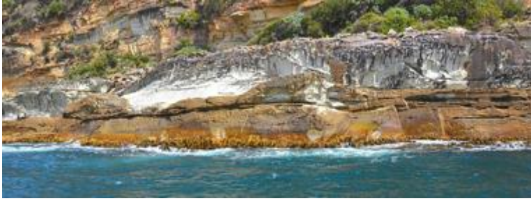
Sandstone etched by wind salt and waves.

From Adventure Bay your can drive over Mount Mangana, through the Sate Forest Reserve to Lunawanna, Cloudy Bay and the Cape Bruny Island Lighthouse. The forest has many examples of prehistoric species.