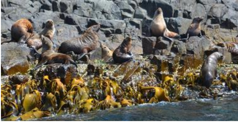
There are a few thousand seals in the colony.