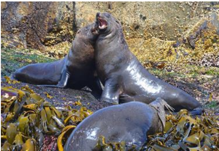
Family chat or sharing fishing secrets. I was told they love calamari.